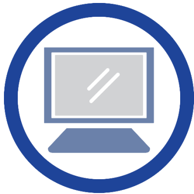
Gauging Your Technology Skills