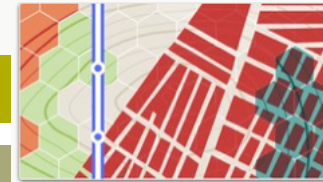
Maps and the Geospatial Revolution Jul 17th 2013