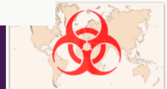
Epidemics - the Dynamics of Infectious Diseases Oct 15th 2013