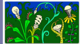
Creativity, Innovation, and