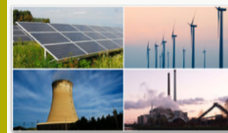
Energy, the Environment, and Our Future Sep 16th 2013