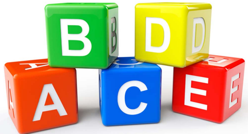
ABCDE image from www.shutterstock.com