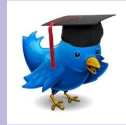
Twitter teacher.