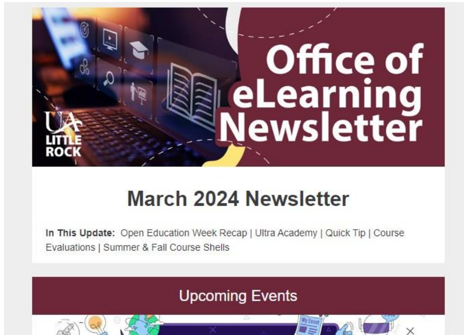
1 - Image of Newsletter